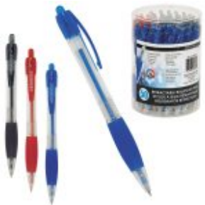
38N2-4242-00-000 - 50 PACK COMFORT CLICKERS PENS SKU: 38N2-4242-00-000