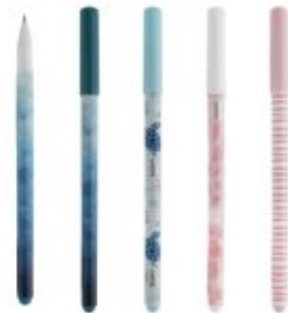
38N2-4541-00-000 - PENS WITH OCEAN THEMED WRAP, 4 PACK SKU: 38N2-4541-00-000