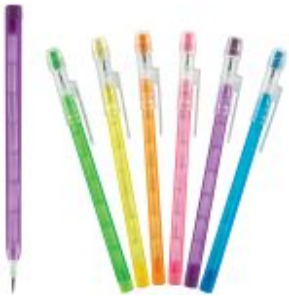
38N1-2000-00-000 - STACKABLE PENCILS, 6 PACK SKU: 38N1-2000-00-000