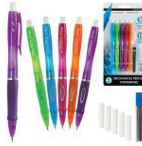
38N1-4141-00-000 - 5 PACK COMFORT GRIP MECHANICAL PENCILS SKU: 38N1-4141-00-000