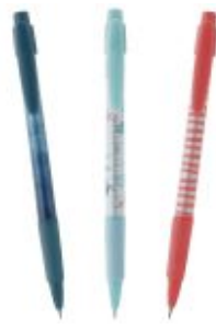
38N1-4011-00-000 - 3 PACK MECHANICAL PENCILS SKU: 38N1-4011-00-000