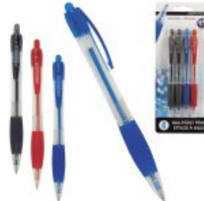
38N2-9131-00-000 - 4 PACK COMFORT CLICKERS PENS SKU: 38N2-9131-00-000