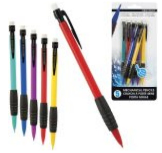
38N1-9221-00-000 - 7 PACK COMFORT GRIP MECHANICAL PENCILS SKU: 38N1-9221-00-000