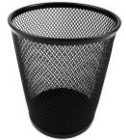
MESH PENCIL CUP, MEDIUM