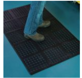
GREASE RESISTANT DRAIN MAT, 3' X 5', BLACK