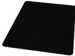
CHAIR MAT, 36" X 48", HARD FLOORS, BLACK