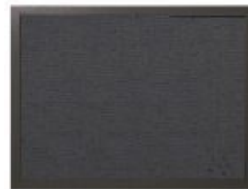
BLACK FABRIC BULLETIN BOARD, 18" X 24"