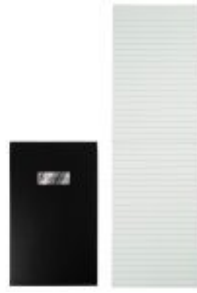
MEMO BOOK, 6-3/4 X 4"