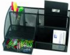
DESK ORGANIZER WITH DRAWER