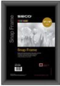
SNAP POSTER FRAME, 12 X 18", BLACK