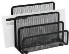
MINI LETTER SORTER, 4 SLOTS