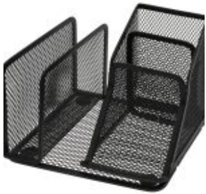
DESK ORGANIZER, 5 COMPARTMENTS