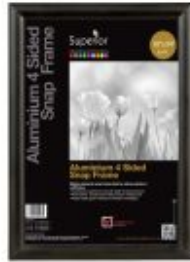
SNAP POSTER FRAME, 18 X 24", BLACK