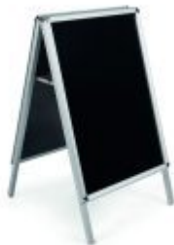
MAGNETIC SIDEWALK SIGN BOARD, A-FRAME, 35" X 25"