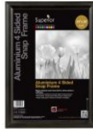
SNAP POSTER FRAME, 24 X 36", BLACK