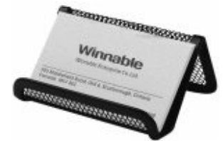
BUSINESS CARD HOLDER, WINNABLE