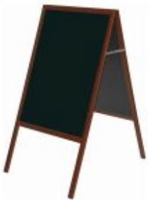
MAGNETIC WET ERASE A-FRAME SIGN BOARD, 33" X 21"