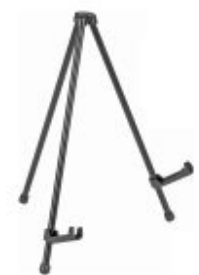
TABLETOP TRIPOD DISPLAY EASEL, 14" X 11"