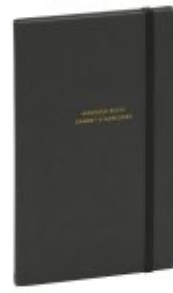
ADDRESS BOOK, 5 X 8"