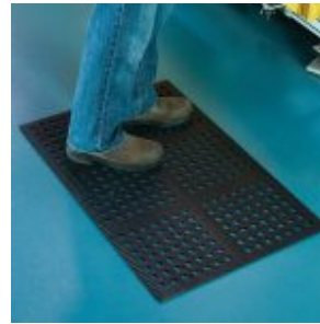
GREASE RESISTANT DRAIN MAT, 2' X 3', BLACK