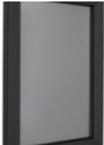
SNAP POSTER FRAME, 27 X 41", BLACK