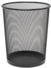
ROUND WASTE BASKET