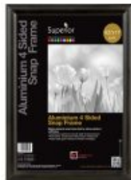
SNAP POSTER FRAME, 8.5 X 11", BLACK