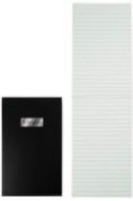
TOP COIL MEMO BOOK, 3-1/2 X 6"