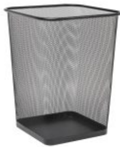
SQUARE WASTE BASKET