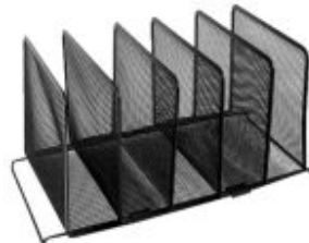
MESH FILE SORTER, 5 SLOTS