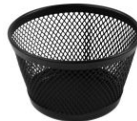
PAPER CLIP HOLDER