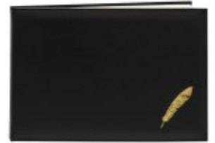
EMBOSSSED GUEST BOOK, BLACK