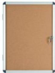
EARTH ENCLOSE LOCKABLE CORK BOARD, 19" X 26"