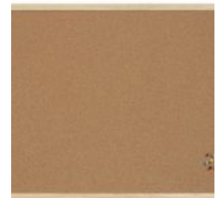
DOUBLE-SIDED CORK BOARD, 18" X 24"