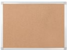
EARTH CORK BULLETIN BOARD, 48" X 72"