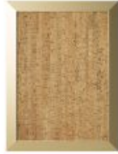
KAMASHI CORK BULLETIN BOARD, 18" X 24"