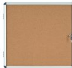
EARTH ENCLOSE LOCKABLE CORK BOARD, 28" X 26"