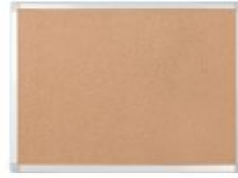
EARTH CORK BULLETIN BOARD, 36" X 48"