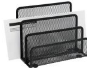
MINI LETTER SORTER, 4 SLOTS