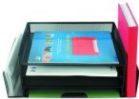
MESH DESK TRAY SORTER