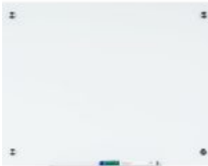
RIVER GLASS DRY- ERASE BOARD, 18" X 24"