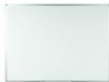
AYDA STEEL DRY- ERASE BOARD, 18" X 24"