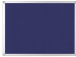
AYDA BLUE FELT BULLETIN BOARD, 18" X 24"