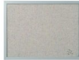
GRAY FABRIC BULLETIN BOARD, 18" X 24"