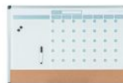
DRY-ERASE 3-IN-1 CALENDAR PLANNER BOARD, 18" X 24"