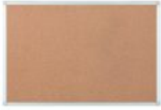
AYDA CORK BULLETIN BOARD, 18" X 24"