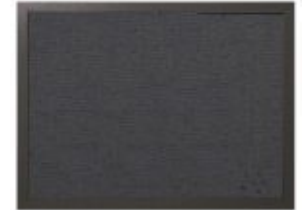
BLACK FABRIC BULLETIN BOARD, 18" X 24"