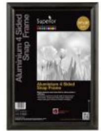
BLACK SNAP FRAME 24 X 36