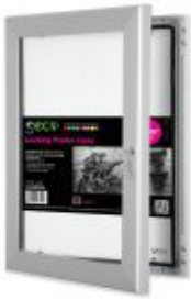
LOCKING POSTER CASE 24X36, SILVER