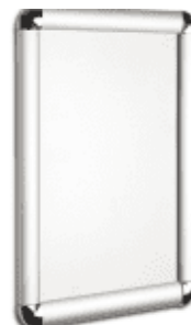
SNAP POSTER ROUND FRAME, 24 X 36", SILVER