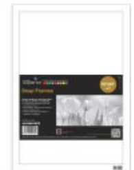
WHITE SNAP FRAME 24X36" -1" PROFILE