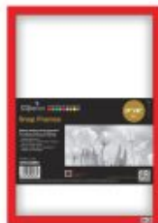
RED SNAP FRAME 24 X 36"-1" PROFILE