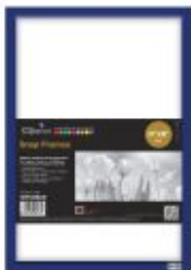
BLUE SNAP FRAME 24X36" -1" PROFILE