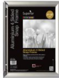
SNAP FRAME 24 X 36, SILVER