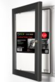
LOCKING POSTER CASE 24X36, BLACK